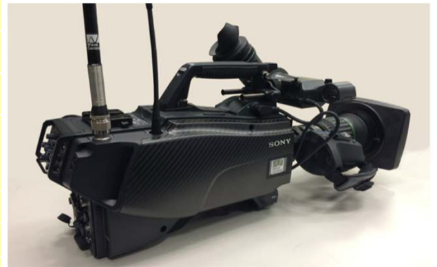
The AX-SSK is Integrated in the Sony Side Panel of a Sony HDC2500.